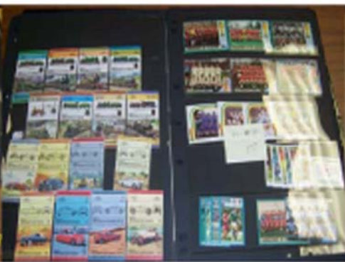
Lot # 44