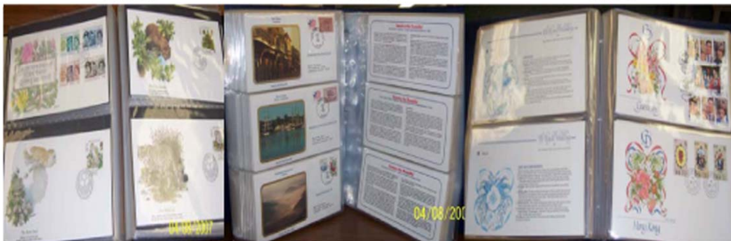
Lot # 20