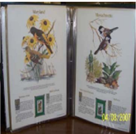
Lot # 60