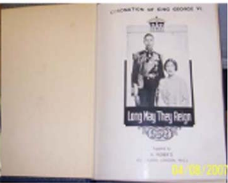
Lot # 51