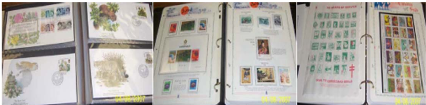
Lot # 2