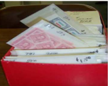
Lot # 55