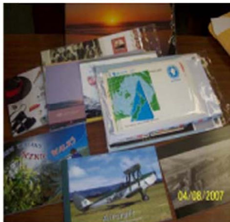
Lot # 54