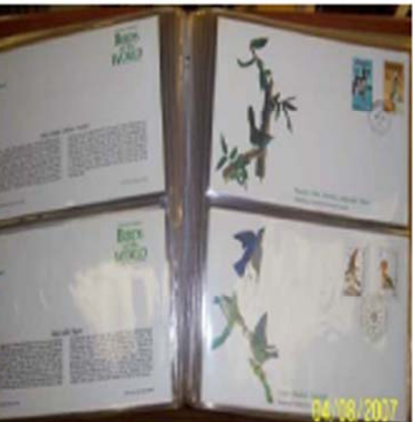
Lot # 62