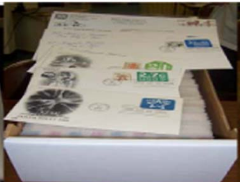
Lot # 58