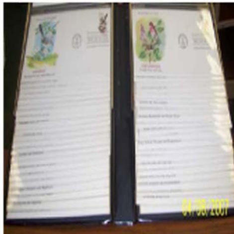
Lots # 27 & 59