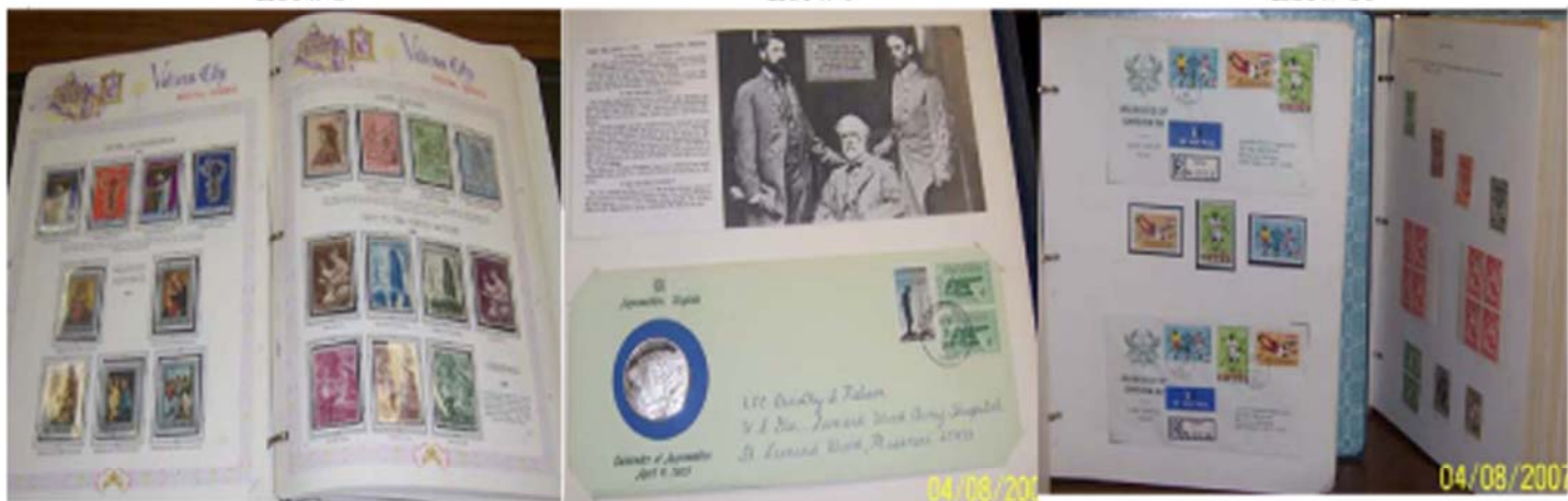
Lot # 14