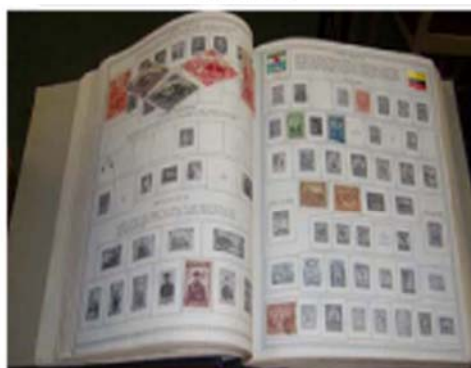
Lot # 53