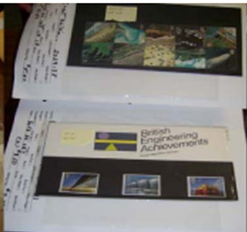
Lot # 56