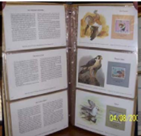
Lot # 61