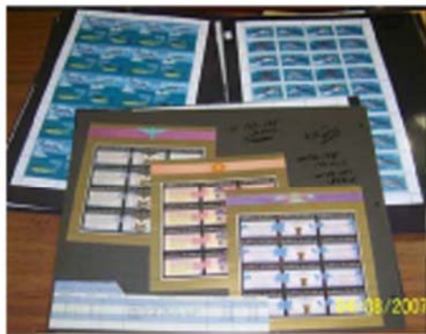
Lot # 42