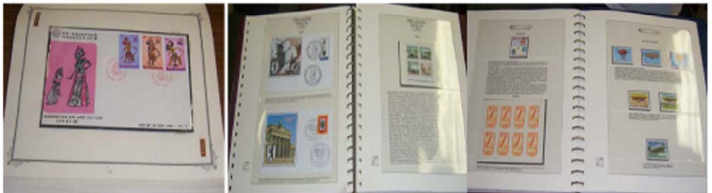
Lot # 8